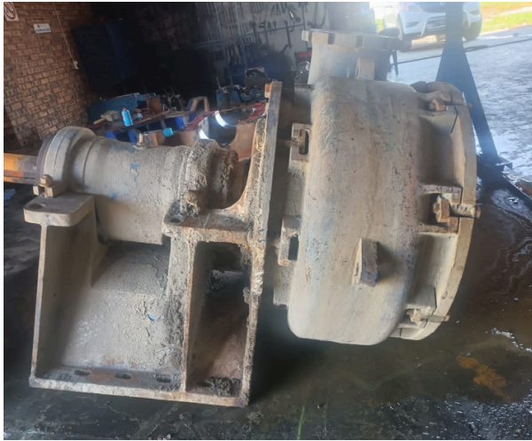
ME 35 – Before