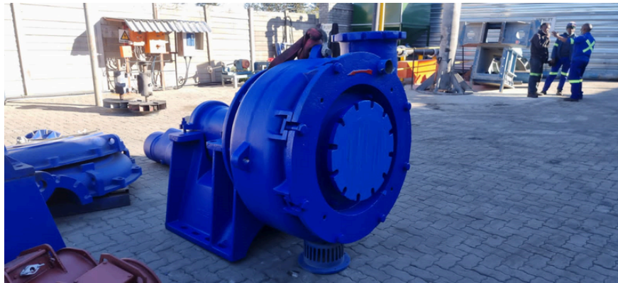
ME 35 – After