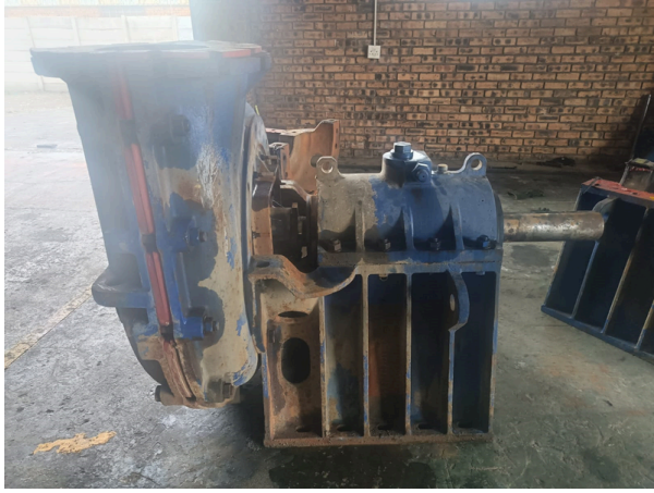
M350 – Before