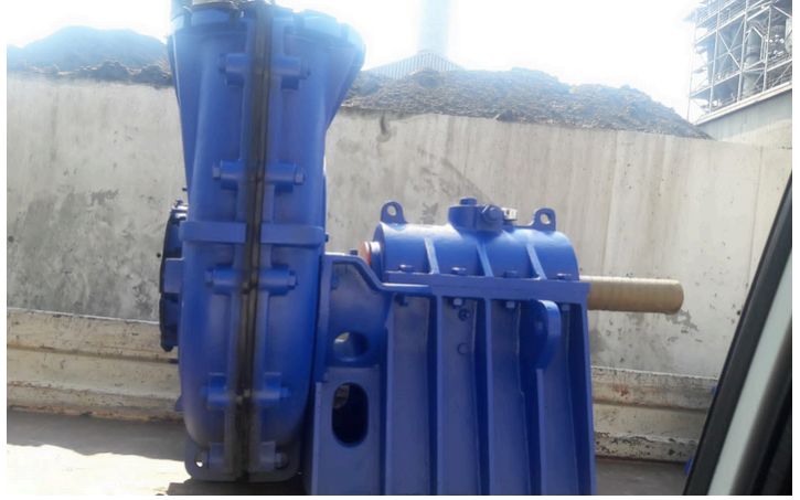
M350 – After