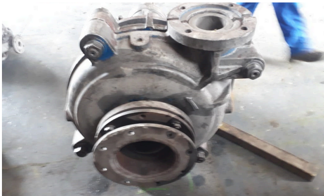
4/3 D Before